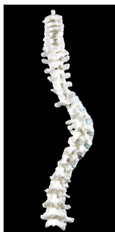
3D model of spine with replica polymer vertebrae created by laser sintering

Richard III was king of England from 1483 to 1485, after declaring his nephew, Edward V, illegitimate. On Aug 20, 1485, Richard was killed in battle with the rebel Lancastrian claimant Henry Tudor at Bosworth. His body was carried back to Leicester and buried in the Greyfriars Minor Friary, where it remained until its excavation in 2012, when it was seen to have a severe scoliosis. 1